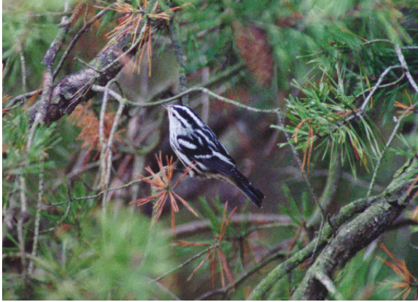
Figure 2. Many neotropical migrant birds, like this black-and-white warbler, use riparian buffers and corridors for breeding and wintering habitat, as well as stop-over habitat during spring and fall migration

Although riparian zones typically are a small component of the landscape, they provide essential habitat for many species of birds (Stevens et al. 1977, Knopf 1985). For example, riparian zones in many areas of the western United States comprise less than 1 percent of the total land area, yet these areas are used by more species of breeding birds than any other habitat in North America (Knopf et al. 1988). Brinson et al. (1981) reported that avian density in riparian areas is often double that of adjacent uplands, although there is regional variation throughout the United States. Approximately 50 percent and 82 percent of bird species of the southwestern United States (Johnson, Haight, and Simpson 1977) and northern Colorado (Knopf 1985), respectively, nest in riparian