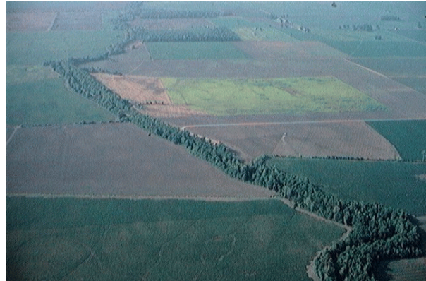
Figure 1. Riparian buffer strips protect water quality and provide habitat for plants and animals, and movement corridors for a variety of wildlife species

BACKGROUND: Over the past several decades, more than 450 Corps of Engineers Civil Works reservoir projects have been constructed in 43 states encompassing nearly 12 million acres (at normal pool elevations, about one half is water and the remaining half is associated land). The majority of inland Civil Works projects are constructed along streams and rivers. There is increasing interest in managing the riparian buffer strips (i.e., vegetation adjacent to streams, rivers, and lakes) along these watercourses. Retaining riparian vegetation of proper width not only minimizes the impacts of erosion and nonpoint-source pollution; these areas also provide habitat and movement corridors for wildlife as well as benefits to fish populations (Fischer et al. 1999) (Figure 1). Unfortunately, when decisions are made to restore or manage buffer strips adjacent to streams and rivers, the basis for determining strip width has been almost completely dominated by water quality considerations. Few studies have addressed the compatibility of recommended buffer strip widths with other important ecological functions, especially their ability to sustain native faunal and floral species.